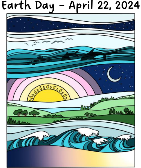
Caring for God's Creation

**Immanuel will be collecting memorabilia to display at the upcoming 125<sup>th</sup> celebration. Start gathering your things and watch for a Sunday to bring them. All items will be returned; make sure your name is on them to ensure that they are returned.