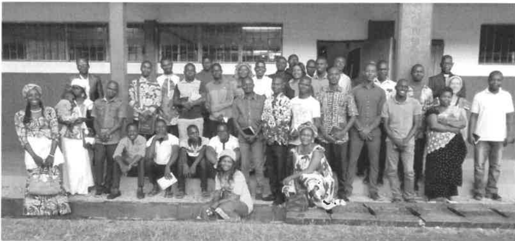
Beginning of the 2020-2021 academic year at the Lutheran Institute of Theology at Meiganga

At the Lutheran Institute of Theology, we were able to start the 2020-2021 academic year on schedule at the beginning of October. Our total number of students is around 50 as usual, but what is new this year is that we have seven female students – an all-time high! The first semester is progressing well.