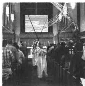
Offering for Youth Travel & Iowa Pig Project