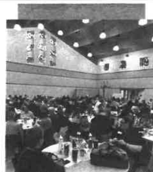
Community Meal with Council Bluffs Residents